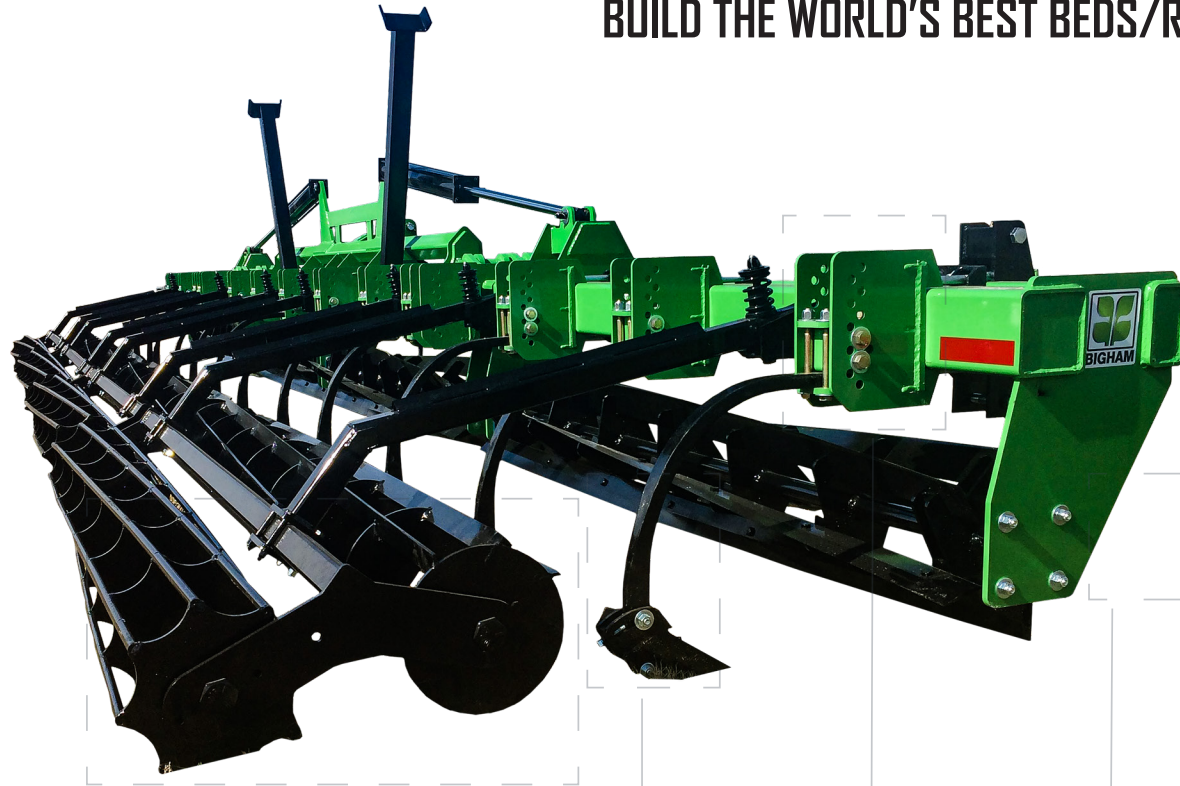
Rear Drum with Scraper Options