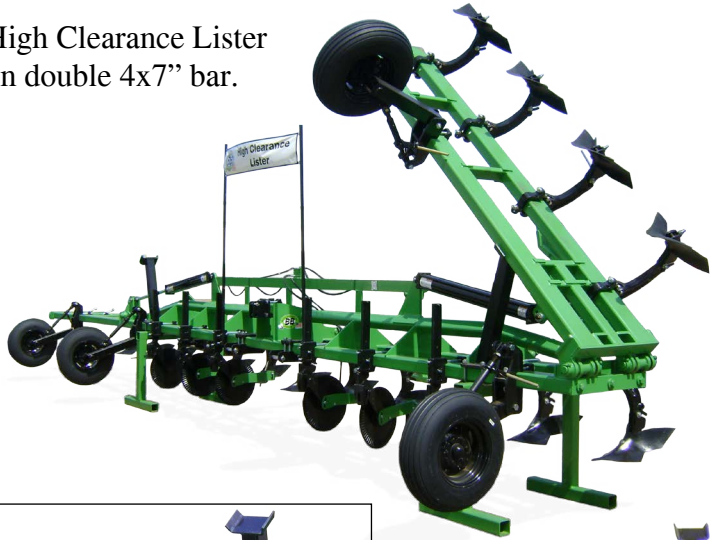
High Clearance Lister on double 4x7" bar.