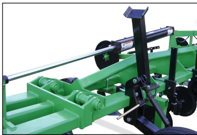
Heavy Duty Hinge with 2" hinge pin, 4x48" cylinder, 4x4" stands to support folded wings.