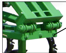
Adjustment bolts allow you to set the down float limit, so wings stay flat or at maximum desired downfloat.

Bigham Brothers offers a wide selection of tool bars. Please call for custom order information.