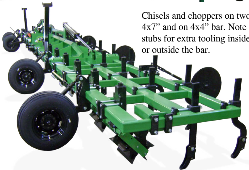
Chisels and choppers on two 4x7" and on 4x4" bar. Note stubs for extra tooling inside or outside the bar.