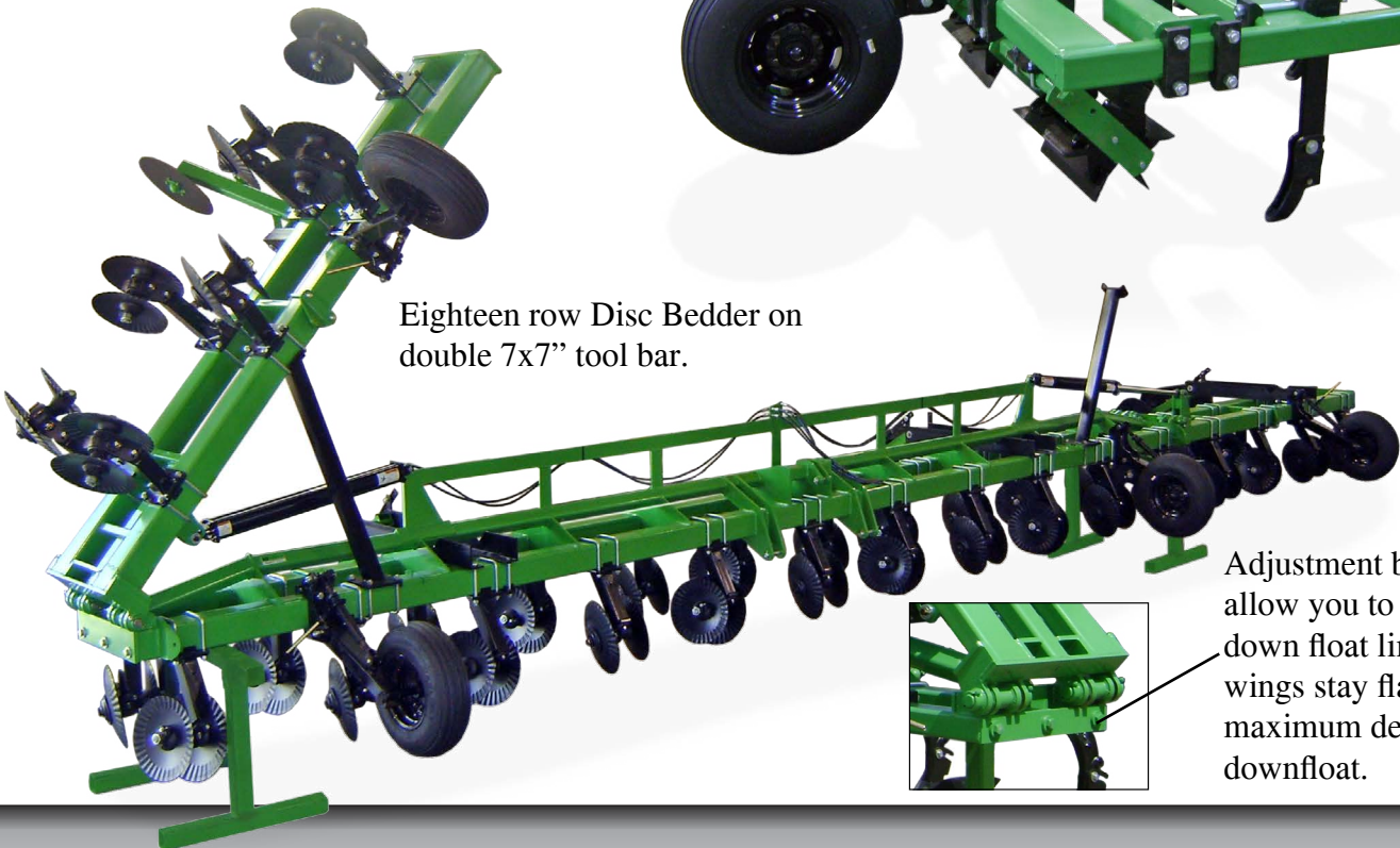
Eighteen row Disc Bedder on double 7x7" tool bar.