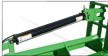
Eyebolt Adjusting Kit for wing lift lug is standard equipment on all tool bars. Linkage may be adjusted so that wing will not float past the flat position. 4x48" Cylinder lifts the heaviest loads.