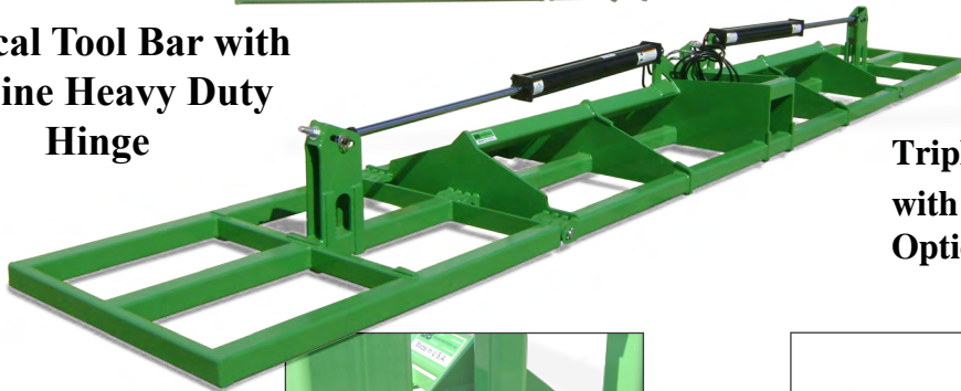
Triple 4x4" Bar with Heavy Duty Option.