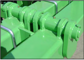
Heavy Duty Hinge with 2" hinge pin.