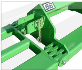
Standard Hinge with seven ears per hinge.