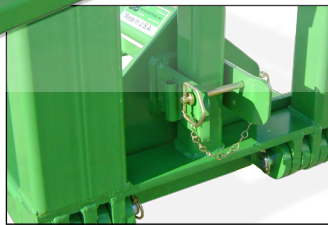
Transport Lock is standard equipment on most vertical fold tool bars. This safety measure could prevent injury or equipment damage while transporting implement from one field to the next.