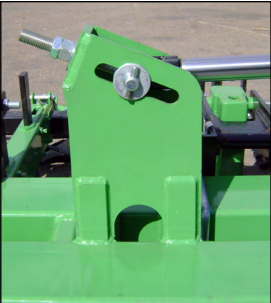
Unique Eyebolt Adjusting Kit allows up float, down float, or both.